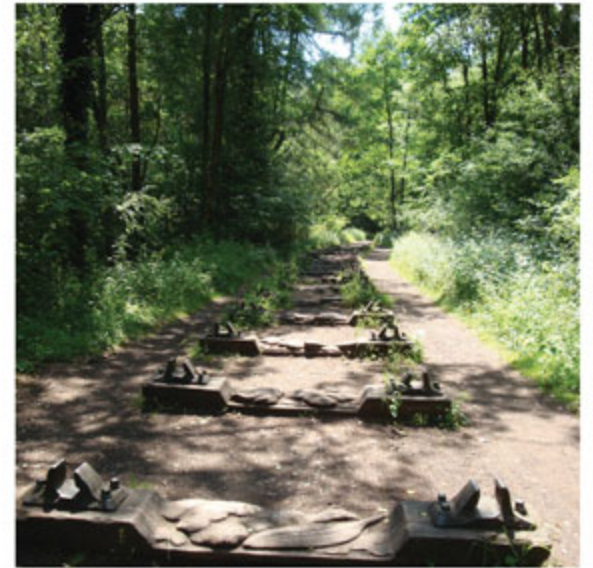
Look and feel