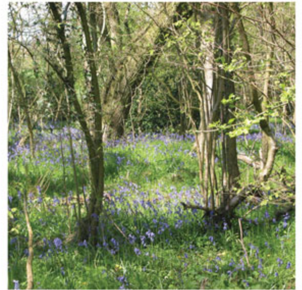
Look and feel