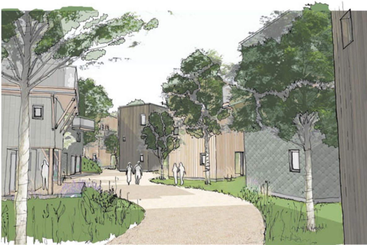
Sketch perspective street view walking through the cabins