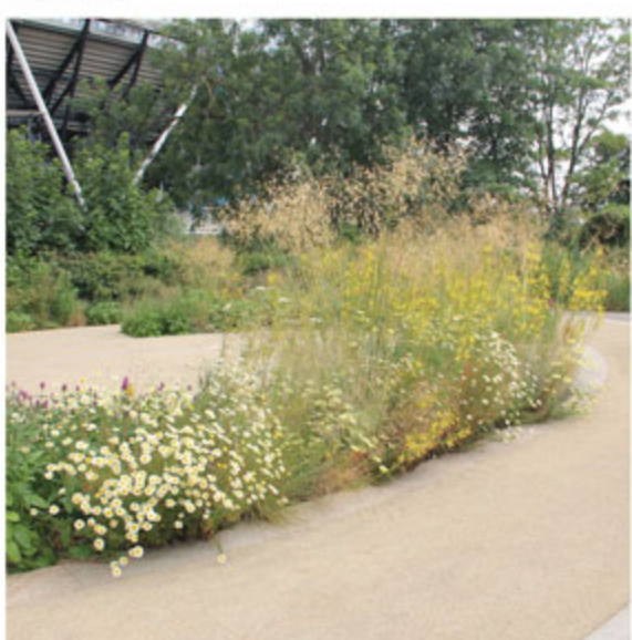
Look and feel