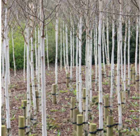
Look and feel